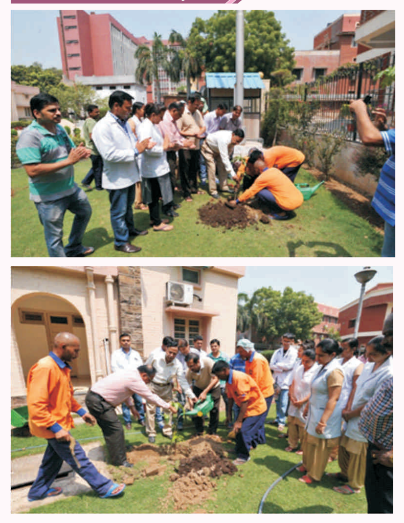
The Director, staff and students of VPCI celebrated the World Environment Day on 5<sup>th</sup> June 2016 by planting saplings in the Institute premises.