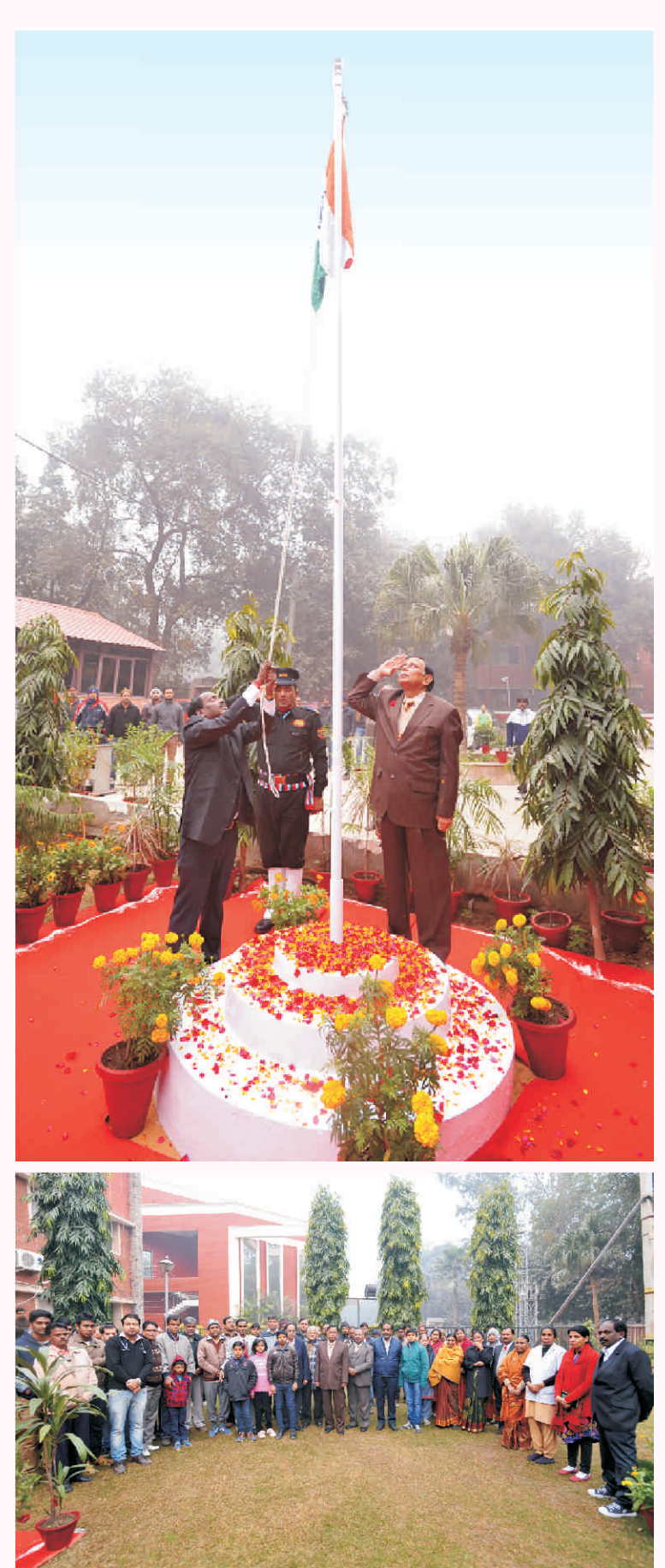
The 67<sup>th</sup> Republic Day function was celebrated on 26<sup>th</sup> January 2016 at the VPCI campus. The ceremony was attended by VPCI staff with their family members. The indoor patients of VPCI also attended this function.